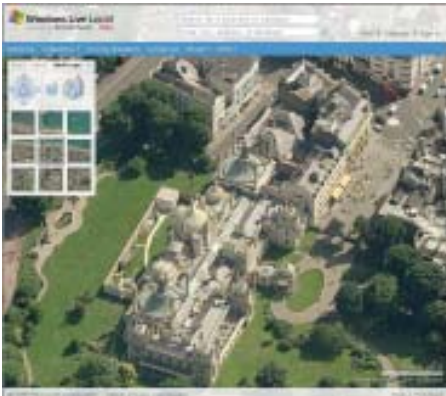
A bird's eye view of the Brighton Pavilion as seen by Live Local, http://local.live.com/ , powered by Virtual Earth.

This deal was done to help fulfil Microsoft's vision to create Virtual Earth, a digital world that will change the way that people navigate, explore and discover information on the internet. Vexcel's extensive experience in imagery, 2-D and 3-D, will enable rich sets of aerial, bird's-eye and street-side imagery to be delivered to the Virtual Earth system. So the team, that everyone knew formally as Vexcel UK, will now become a part of the 3D Imagery Team within Microsoft's Virtual Earth organisation.