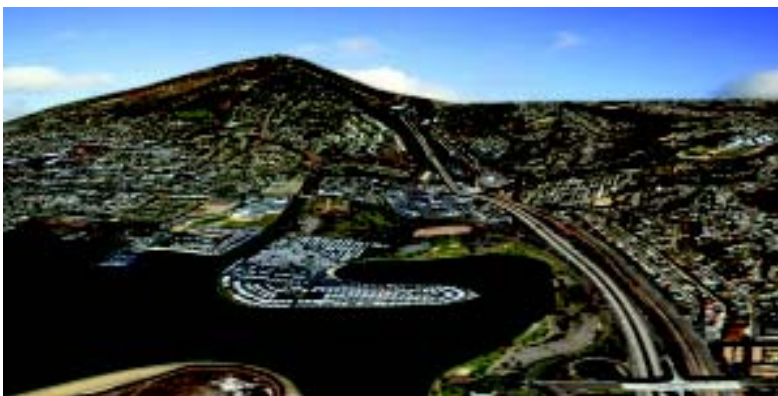
Users can view and move within an imagery scene in a three dimensional perspective.

A new version of BAE Systems' SOCET GXP™ software has added tools for image analysis, geospatial analysis, 3D simulation, and targeting – applications that will be particularly helpful for homeland defence or military intelligence missions.