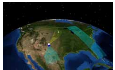
Simulation of continuous imaging and direct download over the USA from the UK DMC-2 satellite

For more information, please contact: info@infoterra-global.com