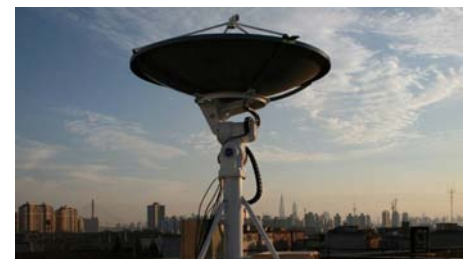
The eOsphere Ground Station installed in Shanghai, China.

Particularly successful last year was the VxEos Ground System, which is eOsphere's turnkey solution for EOS Terra and Aqua MODIS data reception. This is designed for users who want to receive and process data from EOS Terra and Aqua MODIS and the planned NPP and NPOESS satellites. During 2007, eOsphere ground stations were installed in China, Mongolia and Iraq.