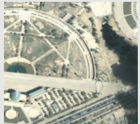
Crossed Sword Archway – Baghdad