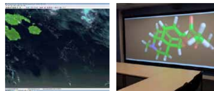
3D Cave imagery.

The facility was installed by Virtualis and is operated by STFC. It consists of two high-luminance active stereo 3D projectors, giving a total screen resolution of 3400 x 1200 on a large 5.5 x 1.9 m screen, together with a high-power graphics workstation, a head-tracking system and a touch-screen command-and-control system. Available software includes Geo-visionary, Paraview, Chimera, TechViz, OpenSceneGraph and 3D Slicer.