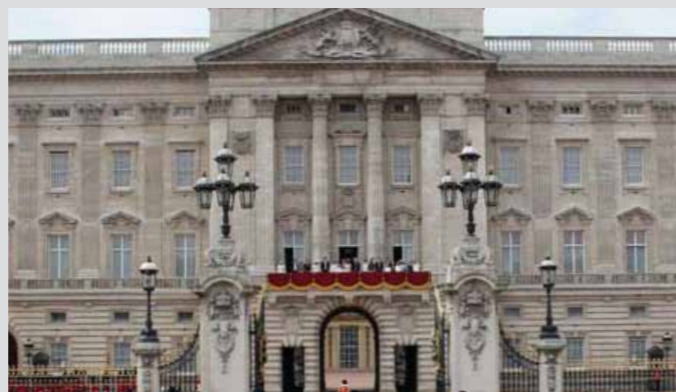
Buckingham Palace, London.

The dinner was an opportunity to highlight the work of ISIC in stimulating economic growth through innovation in the use of Space across a number of downstream services.