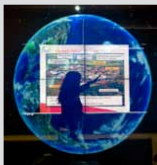
Demonstrating the Application Innovation Centre.