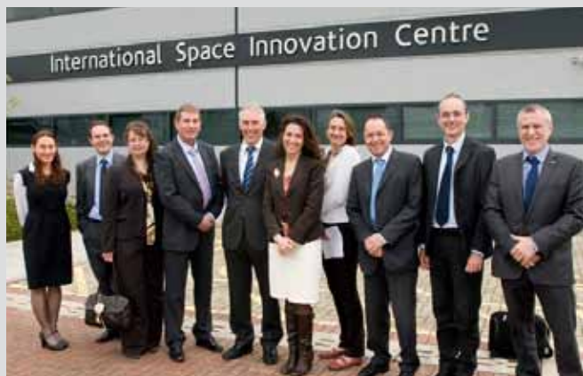
ESA delegation and hosts.