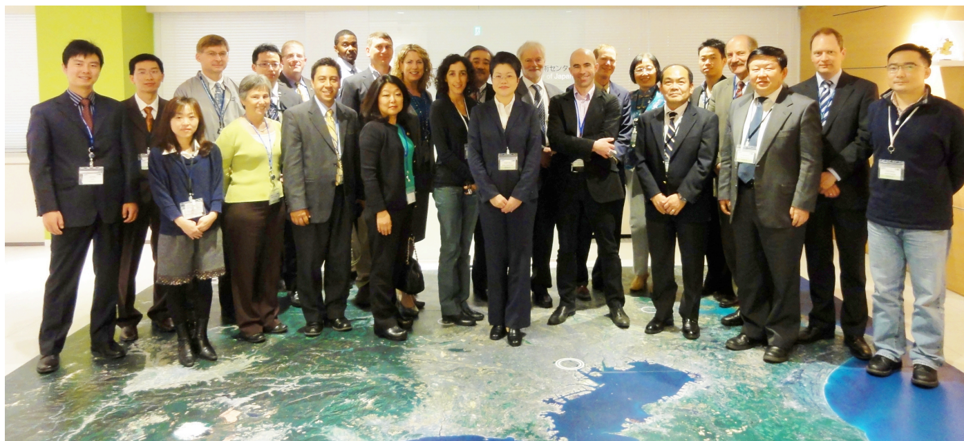
Figure 3: WGISS 33 participants in Tokyo, April 2012.