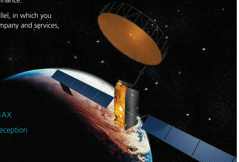
Satellite image